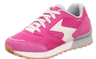
KIDS / TEENS