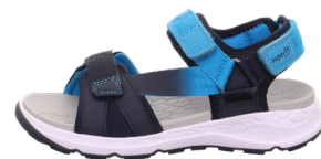
KIDS / TEENS