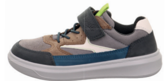
KIDS / TEENS